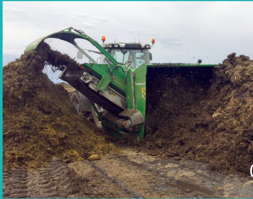
01 TracTurn, material ejection to the right